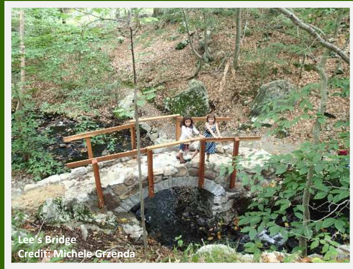
Lee's Bridge