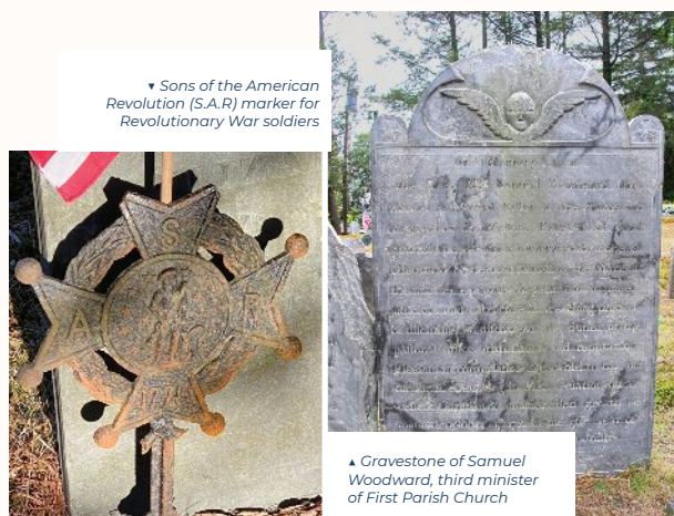
▼ Sons of the American Revolution (S.A.R.) marker for Revolutionary War soldiers

Town leaders and members of Weston's earliest families, including Lamson , Upham , Warren , Hobbs , Harrington , and Coburn .