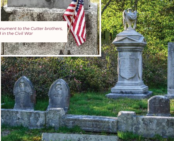
▲ Example of granite curbing