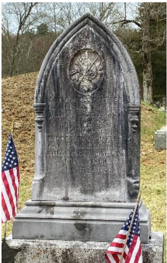
▲ Monument to the Cutter brothers, killed in the Civil War

▼ Plan of Central Cemetery. Family plots were laid out around the "Old Section" (blank area, upper right)