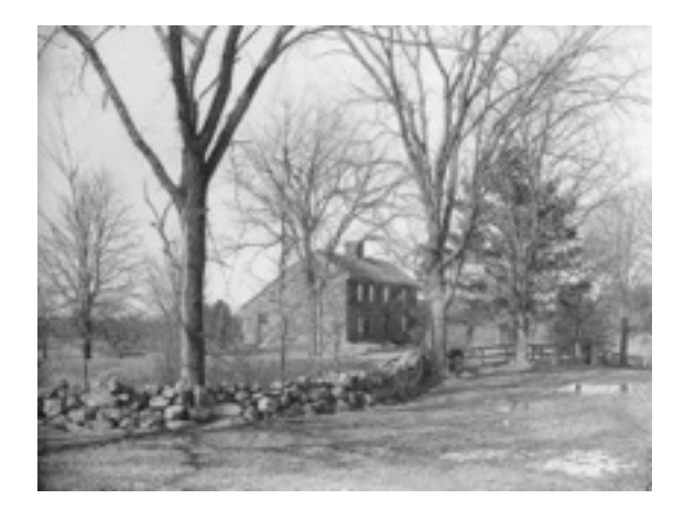
One Chestnut Street,

1695 Weston farmers begin building their own crude, 30-foot-square "Farmers' Meeting House."