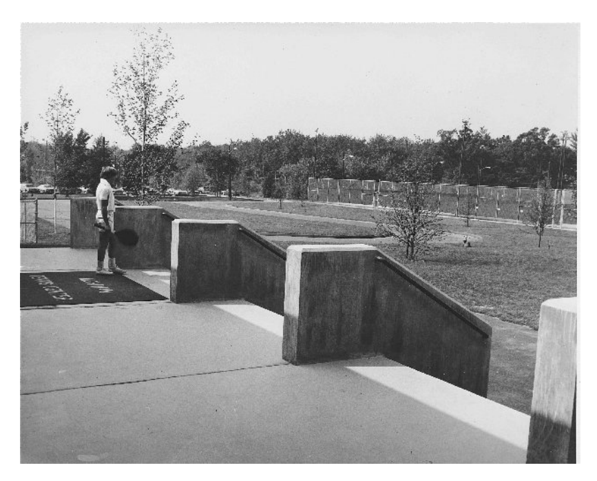
This photo, taken shortly after the opening of the clubhouse in 1970, shows the original design for the stair railings leading up to the main entrance.

volved closing the facility for four days in June and was discontinued. From about 1974 to 1988, Wightman had an age-group swimming team.