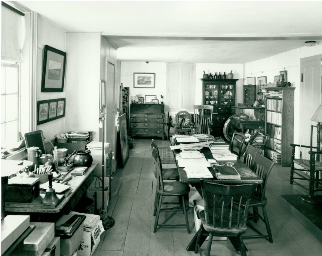
1987 photographs shows the woodshed at the southwest corner of the Josiah Smith Tavern, where a piece of the Burgoyne Elm was stored for many years (left) and the southwest room of the Josiah Smith Tavern, headquarters of the Weston Historical Society (below).