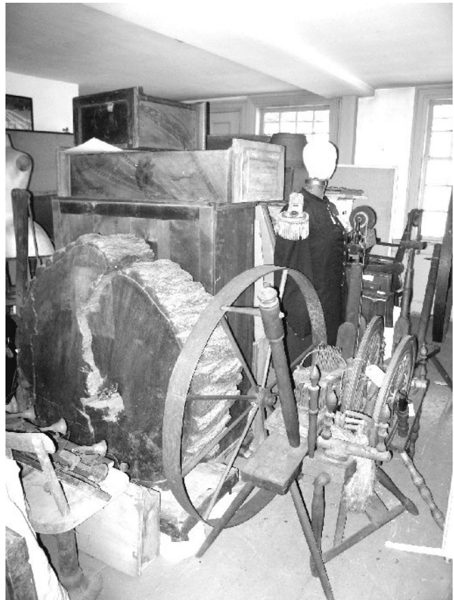
During the recent exterior restoration of the tavern, objects in the collection of the Weston Historical Society had to be moved out of the attic and woodshed to the first floor. This moving has forced the society to take a hard look at what we have and ask the question, "What is it that we should be collecting?"

The recent restoration did not include the interior. The tavern has had no running water