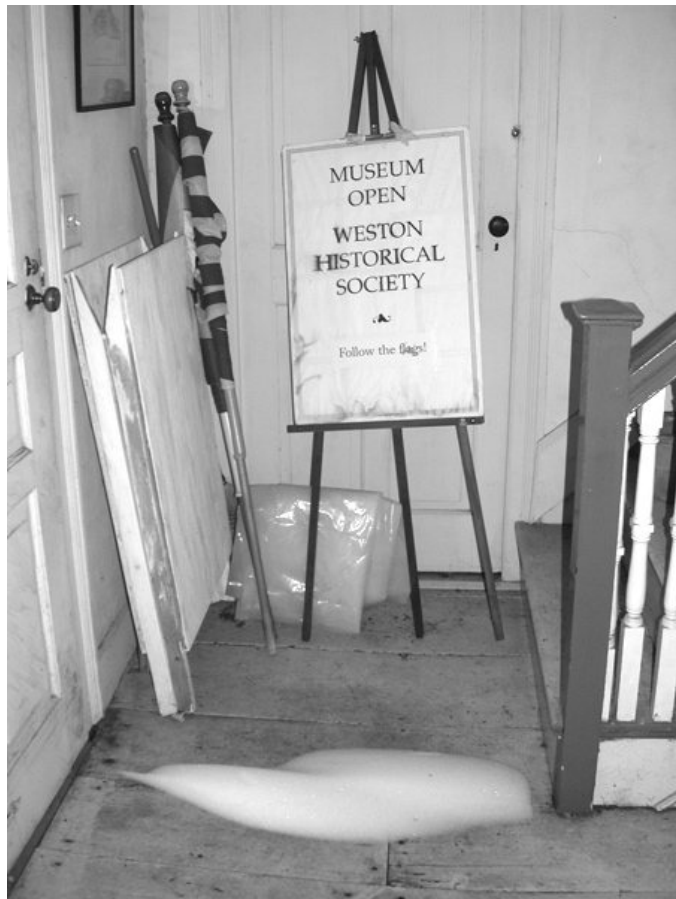
Photograph of the entry hall at the Josiah Smith Tavern in the winter of 2006-07, showing snow that blew in under the door.

While we have spent time creating a functional working environment, the society is aware that we occupy space in the tavern on a temporary basis at the discretion of the selectmen. The newly reconstituted Josiah Smith Tavern/Old Library Committee is working on a proposal that would adapt the tavern, barn, and connector into a restaurant. They are working with an architect and restaurant consultant and hope to have a plan ready for the May Town Meeting. For this plan to go forward, voters will have to allow a full liquor license and be willing to allocate CPA funds. As part of the proposal, the Women's Community League, which has a long-term lease on the barn, would move to the main floor of the Old Library and the historical society would move into the former children's library area and storage rooms on the lower level. There we would join our collections with those of the historical commission and town hall to form what we are calling the Weston History Center and Archives. The work we are doing now to evaluate and organize the society's collections will make this transition easier, if indeed this proposal is adopted by the town.