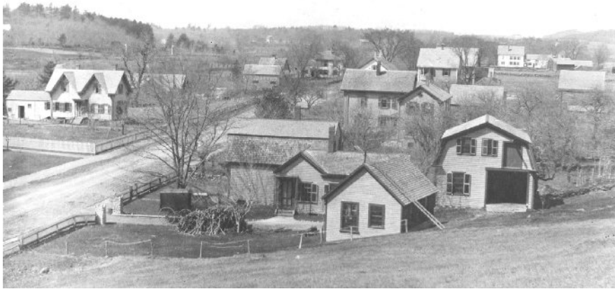
263 North Avenue (lower left) from another angle, looking north-west. At left is No. 272.