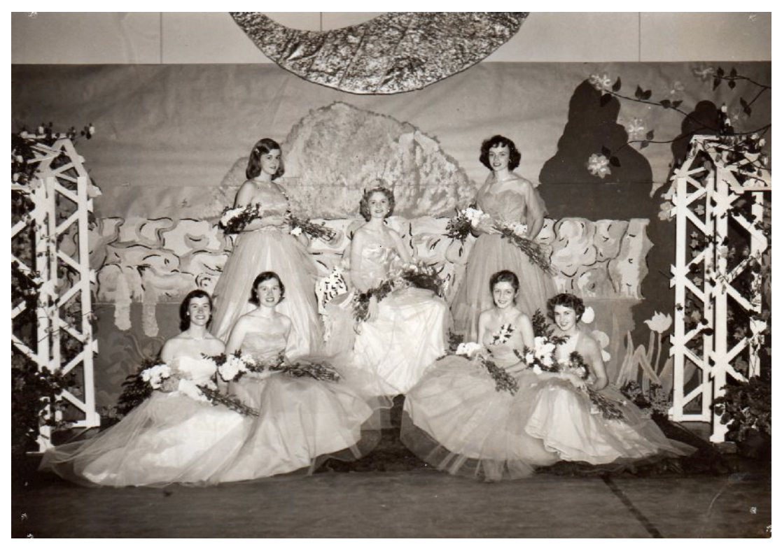
Weston High School prom, 1953-54 school year.

high school became a junior high. In September, 1970, after completion of the present junior high school in 1969, the former junior high was remodeled and made ready for occupancy as an elementary school christened "Field School" following the rural naming theme already established with Country, Woodland, and Brook. At that time Field was used as an "intermediate" school for grades 4, 5 and 6.