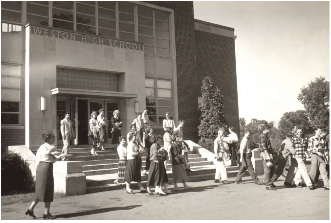
The Field School opened in 1950 as Weston High School and has served the community as a high school, junior high, and upper elementary school. Its future is now under study.