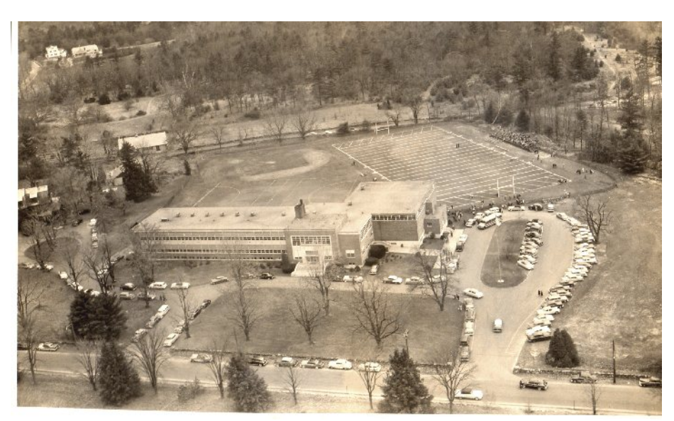
The football field behind Weston High School (now Field School) can be seen in this aerial view probably dating to the 1950s.

Plans changed dramatically after a disastrous April 7, 1948, fire that gutted the Weston High School (now Brook School Apartments C). At a Special Town meeting a few weeks later in May, Town Meeting took quick action, voting to abandon the idea of a new